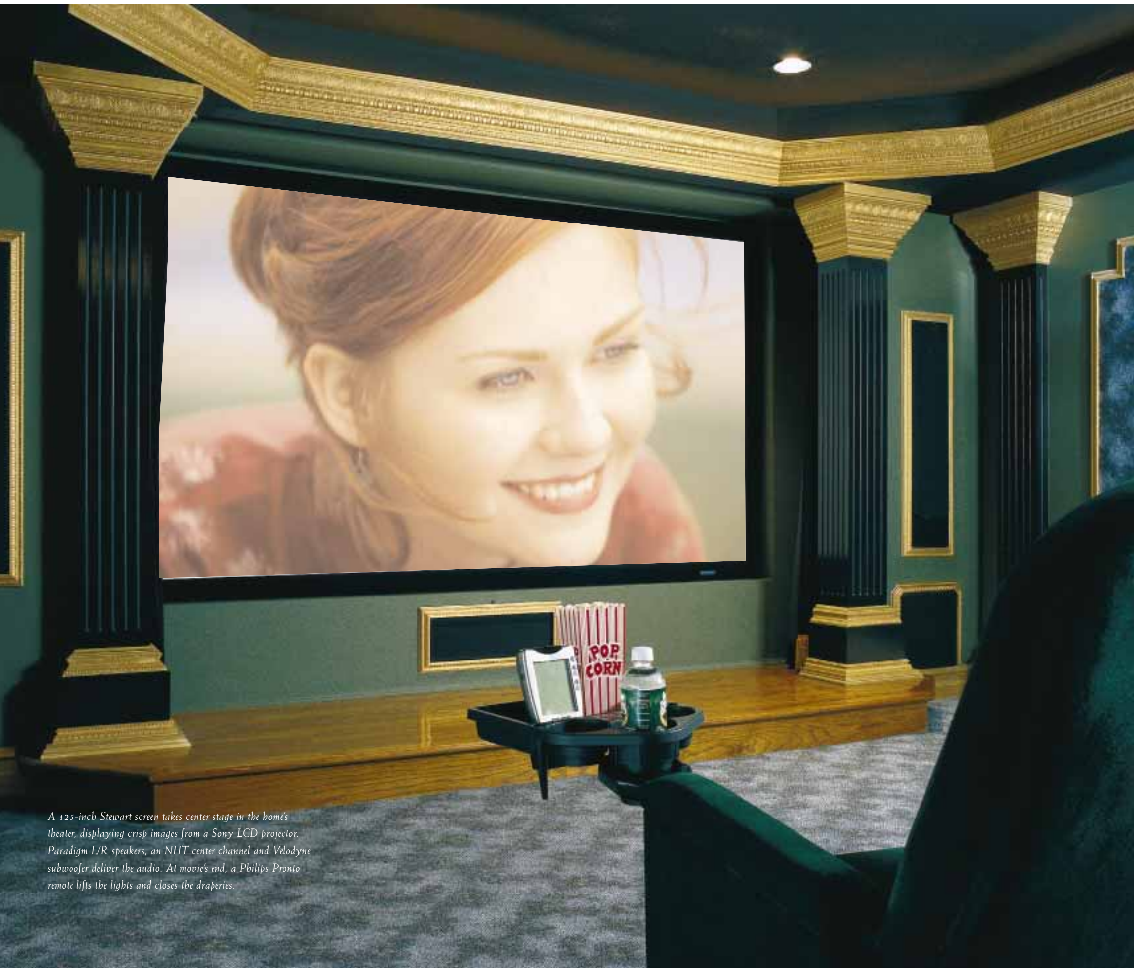
A 125-inch Stewart screen takes center stage in the home's theater, displaying crisp images from a Sony LCD projector. Paradigm L/R speakers, an NHT center channel and Velodyne subwoofer deliver the audio. At movie's end, a Philips Pronto remote lifts the lights and closes the draperies.