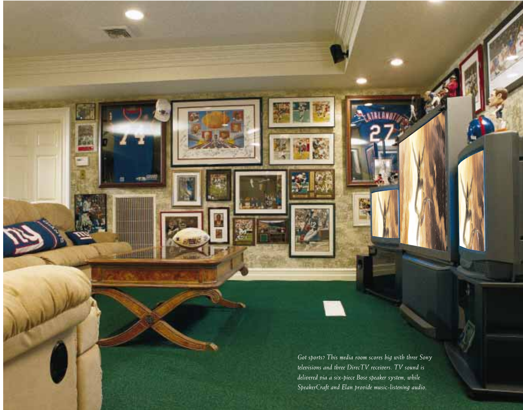
Got sports? This media room scores big with three Sony televisions and three DirecTV receivers. TV sound is delivered via a six-piece Bose speaker system, while SpeakerCraft and Elan provide music-listening audio.

movie watching," says the homeowner. The elegant columns and moldings that line the theater walls and the addition of high-hat and rope lighting create an authentic cinematic atmosphere.